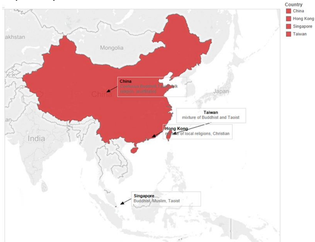
Figure 1: Map of Study Sites

In our review, we observe that the three societies (Figure 1) vary in scale and nature. In particular, the role of government in philanthropy and the relative autonomy of civil society were heavily dependent upon place and context. The societies share similarities in the active role religious associations play in giving. Moving forward, professionalization of the third sector has become a new trend, particularly in Hong Kong, as donors have begun to explore new formats for giving. Competition for funds, in light of decreasing government support, is another growing trend in Hong Kong. Competition is a trend also in Taiwan, where government subsidies for civil society organizations (CSOs) have increased, but so have the number of organizations that must compete for these funds. Singapore has seen diverging generational trends as it begins to position itself as a philanthropic hub; the young Singaporeans are increasingly interested in new mechanisms for giving (similar to Hong Kong’s donors) while older generations are drawn toward traditional forms of giving (through donations).